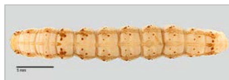
Fig. 2: Late instar larva, dorsal view