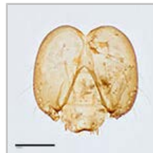
Fig. 14: Head (cleared)