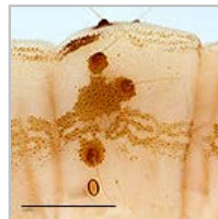
Fig. 12: Pinacula on A1