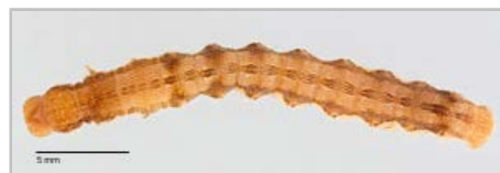
Fig. 6: Mid- to late instar larva, dorsal view