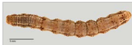
Fig. 4: Late instar larva, dorsal view