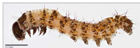
Fig. 8: Early instar larva, lateral view