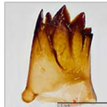
Fig. 17: Mandible