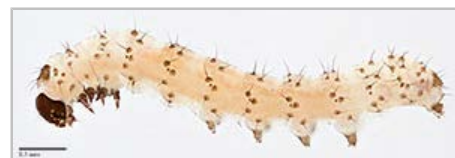
Fig. 9: Early instar larva, lateral view

For European interceptions, when present, large conical pinacula will separate H. armigera from related genera of Heliothinae , but not all specimens are expected to show this character. Perhaps scattered spines on the distal region of the hypopharyngeal complex (Ahola and Silvonen 2005: fig. 1106) is the most distinctive mouthpart character for H. armigera in northern Europe. The final problem is separating H. armigera from H. assulta . Helicoverpa assulta is normally associated only with only Solanaceae (but see Mathews 1999: 117, 118) whereas H. armigera is polyphagous. Differences in cuticular texture will separate the two species on solanaceous hosts. Sannino et al (1996) compared H. peltigera to H. armigera and noted major differences in the larval mandibles.