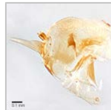
Fig. 15: Hypo. complex