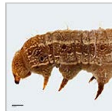
Fig. 11: Head, thorax