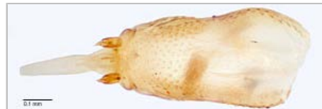
Fig. 16: Hypopharyngeal complex, dorsal view