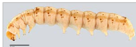
Fig. 1: Late instar larva, lateral view

This ranking characterizes H. armigera as quarantine significant.