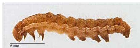
Fig. 7: Mid-instar larva, lateral view