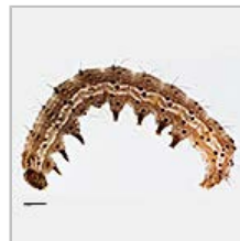
Fig. 10: Mid-instar