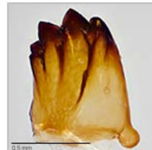
Fig. 18: Mandible