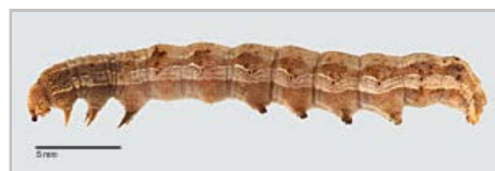
Fig. 3: Late instar larva, lateral view