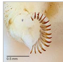
Fig. 13: Crochets