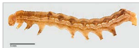
Fig. 5: Mid- to late instar larva, lateral view