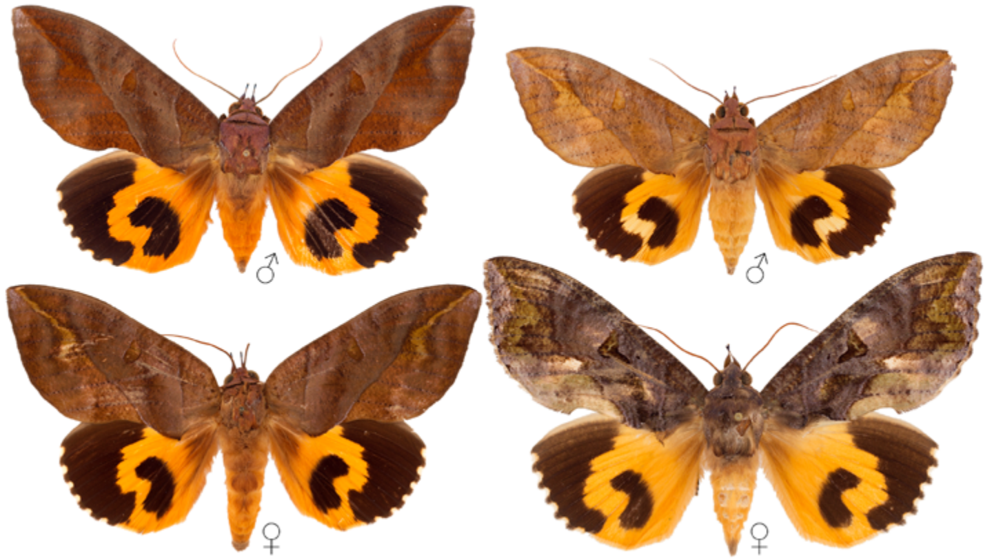
Fig. 4: Eudocima phalonia spread adults. Images are ACTUAL SIZE (wingspan = 70-100 mm).