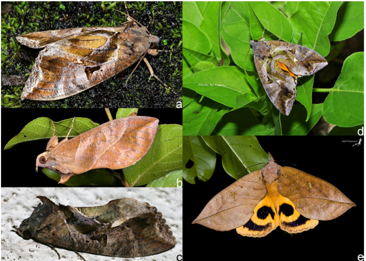
Fig. 3: Live Eudocima adults; a-b: E. phalonia in Taiwan (Photo by Sipher Wu, Flickr); c: E. phalonia in Malaysia (Photo by Alexey, Flickr); d: E. phalonia (Photo by Logan Lai, Flickr); e: E. tyrannus in Taiwan (Photo by Sipher Wu, Flickr).

Eudocima adults usually rest with their forewings folded above their bodies, concealing their bright yellow or orange hindwings. Their large size and unique wing pattern easily distinguishes them from all other genera of North American Lepidoptera. The photos of live resting adults in Fig. 3 illustrate how an individual might appear during a visual survey.