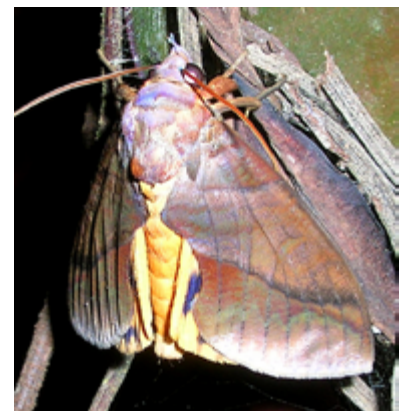
Fig. 2: Live resting E. phalonia adult in India.

CAPS Approved Survey Method: Visual inspection for adults