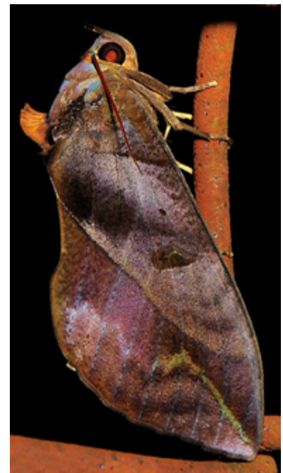
Fig. 1: Live resting E. phalonia adult.

Because no synthetic pheromone is currently unavailable for E. phalonia , this aid is designed to assist in the detection of suspect adults through visual surveys in orchards. Guidelines for visual surveys along with photographs of E. phalonia adults are included here under Level 1 Screening (Page 2). If a suspect E. phalonia adult is found, capture it and submit it to your regional domestic identifier along with the name and location of any associated host. Report any species of Eudocima encountered, even if it does not appear to be E. phalonia .