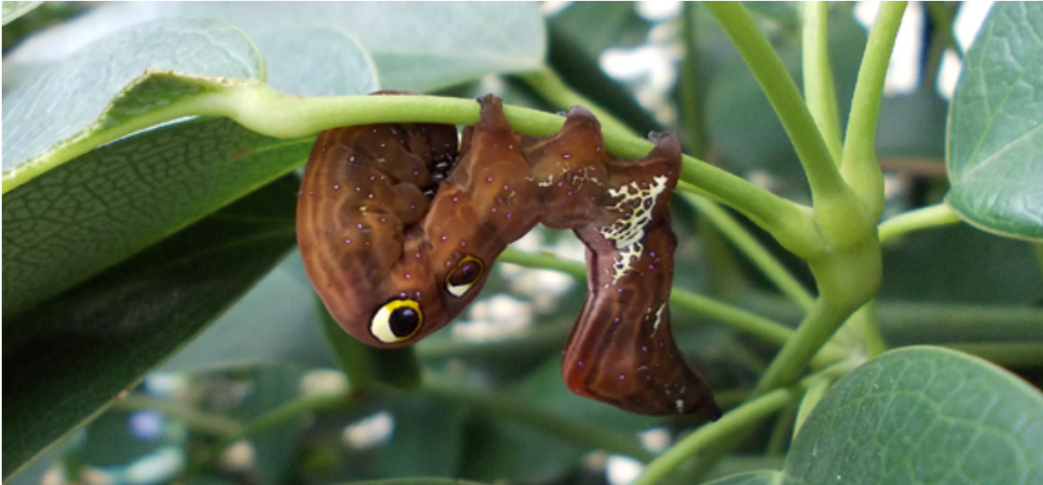
Fig. 6: Larva of Eudocima tyranus ; larvae of E. phalonia are similar.