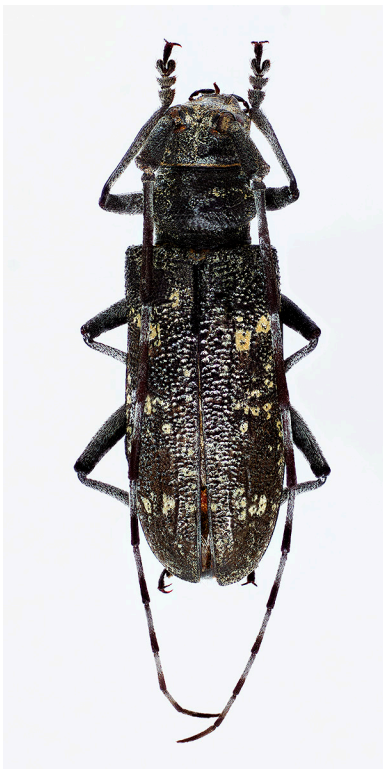
Fig. 11: Monochamus sutor (target)

The elytral apex of M. alternatus (Fig. 21) is more narrowly rounded than that of M. sutor (Fig. 20). Monochamus alternatus is reddish brown to black in color with two broken stripes of orange pubescence on the pronotum (Fig. 27). Two native species, M. carolinensis (Fig. 15) and M. titillator (Fig. 16) bear a close resemblance to M. alternatus (Fig. 14). The three can be distinguished by the unarmed and somewhat flattened elytral apices of M. alternatus compared to the broad tooth seen in M. carolinensis and the narrow conical tooth of M. titillator (Figs. 21-23). Other non-target species (Figs. 17-19) lack the tooth entirely (e.g., Fig. 24).