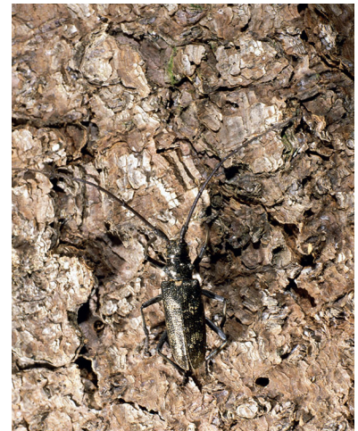
Fig. 1: Monochamus sutor on tree.

The pine sawyer beetles ( Monochamus spp.) are a widespread genus of longhorn beetles with several members of economic importance. Within this group are two species that are considered potentially invasive pests: the small white-marmorated longhorned beetle ( Monochamus sutor ) (Fig. 1) and the Japanese pine sawyer ( Monochamus alternatus ) (Fig. 2). Monochamus alternatus feeds primarily on pines ( Pinus ) but will attack a variety of conifers and some deciduous trees. Monochamus sutor attacks a variety of conifer species including fir ( Abies ), larch ( Larix ), and spruce ( Picea ). Both species are known to carry the pine wood nematode ( Bursaphelenchus xylophilus ) and other phytoparasitic nematodes that are capable of killing trees and spreading bacterial diseases. The beetle itself feeds on the phloem as a larvae and in the crown as an adult (Figs. 3-4) but is unlikely to directly kill its host.