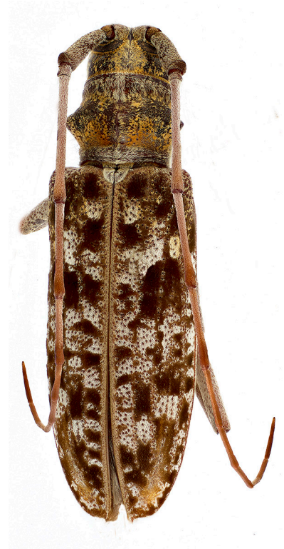
Fig. 16: Monochamus titillator .