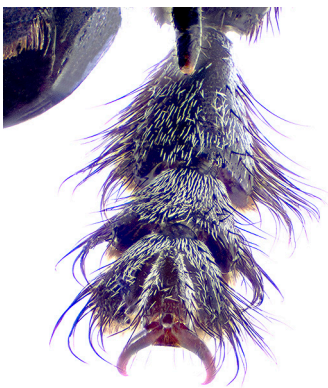
Fig. 8: Tarsal claws of Monochamus sp.