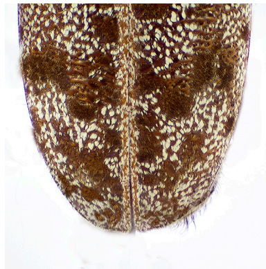
Fig. 24: Monochamus clamator

Figs. 20-24: Elytral apices of various Monochamus spp. The apex of M. sutor is broadly rounded while that of most other Monochamus are more acute and often armed with spines as seen with M. carolinensis and M. titillator . The apex of M. alternatus is narrowed but unarmed.