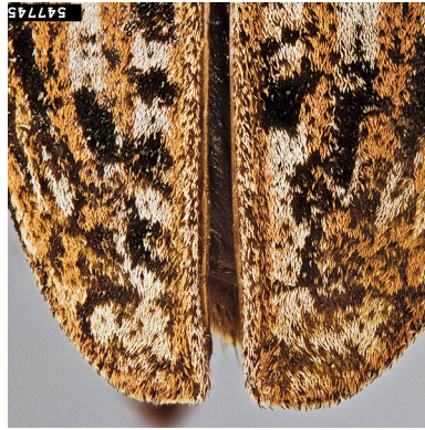
Fig. 21: Monochamus alternatus (target).