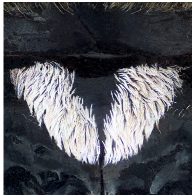
Fig. 26: Monochamus scutellatus .

Figs. 25-26 (left): Scutellums of M. sutor and M. scutellatus . Note the difference in the color of the pubescence.