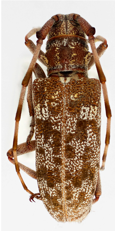
Fig. 18: Monochamus clamator .