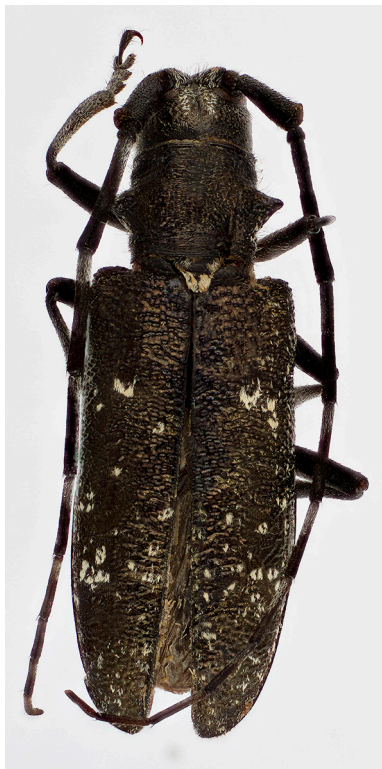
Fig. 12: Monochamus scutellatus