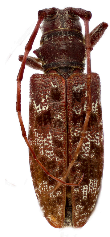
Fig. 13: Monochamus obtusus