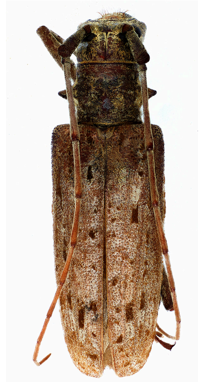
Fig. 19: Monochamus notatus .