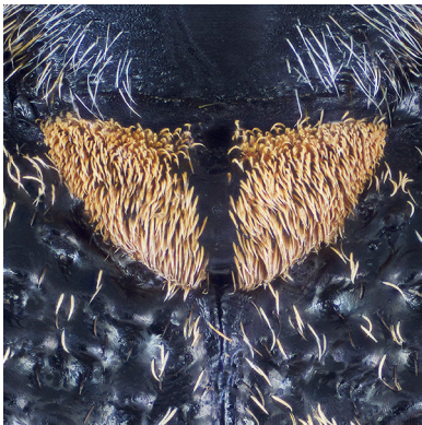
Fig. 25: Monochamus sutor (target).

Figs. 20-24: Elytral apices of various Monochamus spp. The apex of M. sutor is broadly rounded while that of most other Monochamus are more acute and often armed with spines as seen with M. carolinensis and M. titillator . The apex of M. alternatus is narrowed but unarmed.