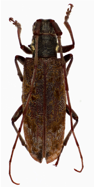
Fig. 17: Monochamus mutator .