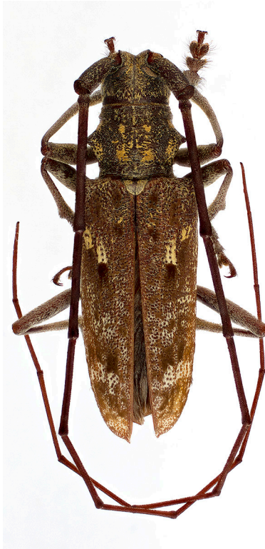
Fig. 15: Monochamus carolinensis .