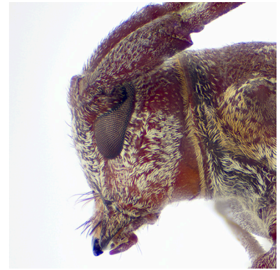
Fig. 7: Head of Monochamus sp. In the Lamiinae the head is vertically oriented with the mouthparts directed ventrally, and the genial margin is directed posteriorly.

The heads of the subfamily Lamiinae are vertical with the genial margin directed posteriorly rather than ventrally (Fig 7).