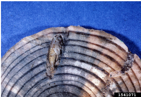
Fig. 3-4: Monochamus sp. galleries infected with bluestain fungi and containing larvae (top) and pupae (bottom). Despite their large size, Monochamus do little direct damage the host tree. They burrow in the phloem and heartwood where they feed on wood and symbiotic fungi. Most trees that are killed die as the result of infection by parasites vectored by the beetle. These include bluestain fungus, the pine wood nematode, and a variety of pathogenic bacteria.