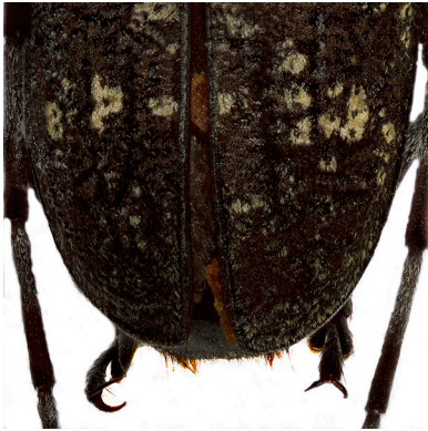
Fig. 20: Monochamus sutor (target).

Monochamus sutor (Linnaeus) and M. alternatus Hope