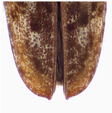
Fig. 23: Monochamus titillator .