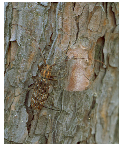
Fig. 2: Monochamus alternatus on tree (photo by William M. Ciesla, Forest Health Management International, Bugwood.org).

This aid is designed to assist in the sorting and screening of M. alternatus and M. sutor suspect adults collected in Lindgren funnel traps and by visual surveys in the continental United States. It covers basic Sorting of traps, First Level, and Second Level screening, all based on morphological characters. Basic knowledge of Coleoptera morphology is necessary to screen for M. alternatus and M. sutor suspects.