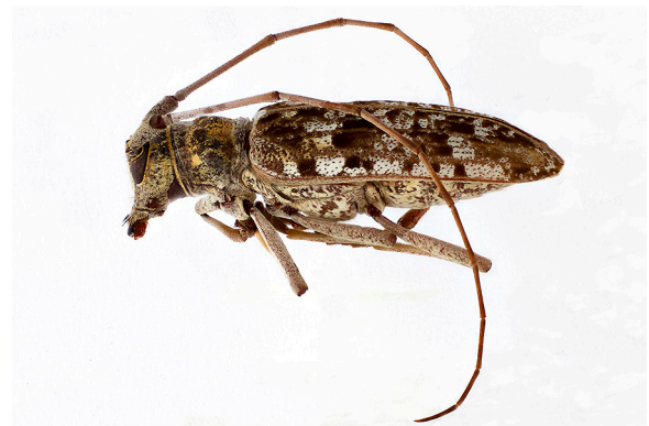
Fig. 6: female Monochamus sp.