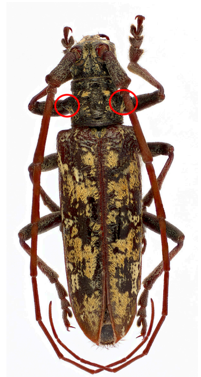
Fig. 10: Dorsal view of Monochamus marmorator . Note the pair of large horns on the pronotum (circled), the coarsely rugose elytral bases, and the uniformly pubescent elytra. Many species have elaborately patterned pubescence.

Specimens meeting these requirements should be forwarded to Level Two Screening.