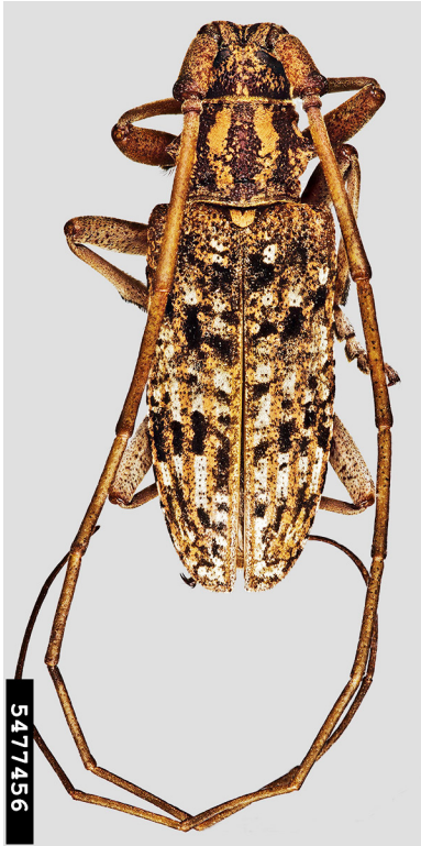
Fig. 14: Monochamus alternatus (target) (Photo by Steven Valley, Oregon Department of Agriculture, Bugwood.org).

Monochamus sutor (Linnaeus) and M. alternatus Hope