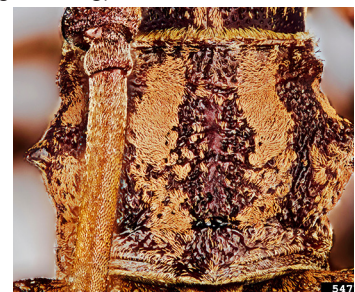
Fig. 27 (below) Pronotum of Monochamus alternatus . Note the two stripes of orange pubescence. (Photo by Steven Valley, Oregon Department of Agriculture, Bugwood.org).

Suspect M. sutor (black cerambycids with vertical heads, a circatrix on the antennae, broadly rounded elytral apices, and small spots of yellow pubescence) and M. alternatus (red-brown cerambycids with vertical heads, a circatrix on the antennae, narrowed but unarmed elytral apices, and two stripes of orange pubescence on the pronotum) should be sent forward for identification. Specimens must be labeled and carefully packed to avoid damage during shipping.