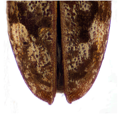
Fig. 22: Monochamus carolinensis .