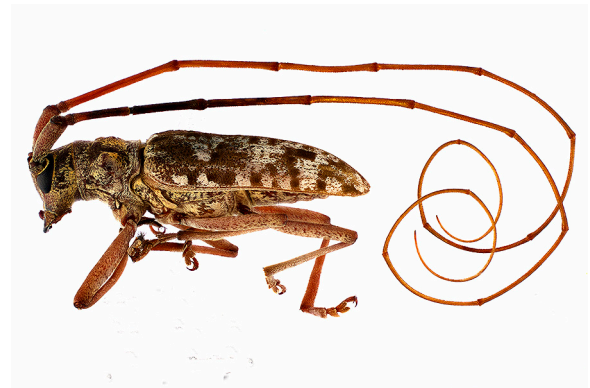
Fig. 5: male Monochamus sp.