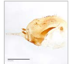
Fig. 11: Hypo. complex