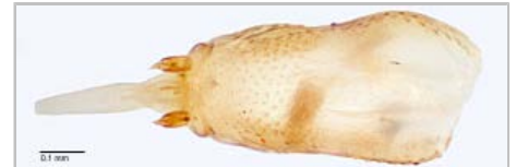
Fig. 12: Hypopharyngeal complex, dorsal view