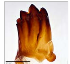
Fig. 14: Mandible