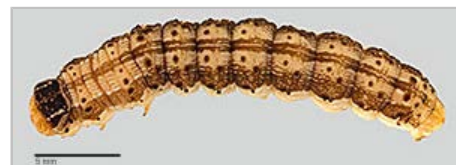
Fig. 1: Late dorsal, lateral view