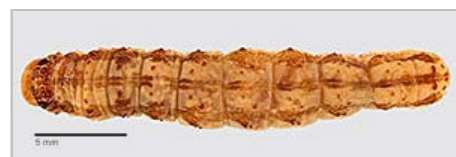
Fig. 4: Late instar, dorsal view