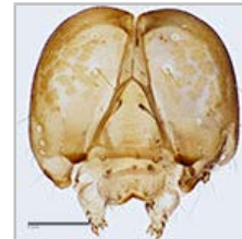
Fig. 10: Head