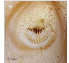
Fig. 9: Crochets