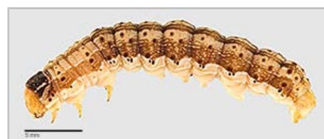
Fig. 1: Late instar, lateral view