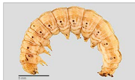
Fig. 2: Late instar, lateral view