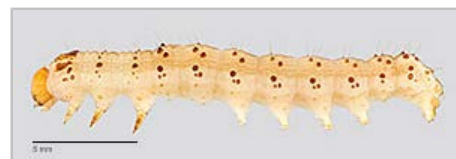
Fig. 3: Mid-instar, lateral view