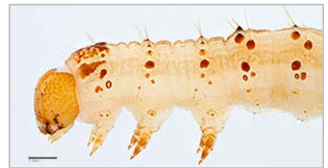
Fig. 7: Mid-instar, thorax