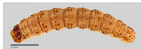
Fig. 5: Late instar, dorsal view