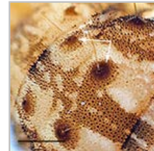
Fig. 8: A8 pinacula