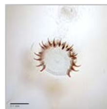
Fig. 5: Crochets