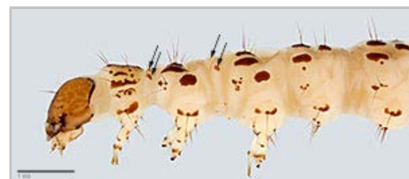
Fig. 4: MD and MSD1-2 setae on T2-3