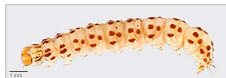
Fig. 2: Late instar, dorsolateral view