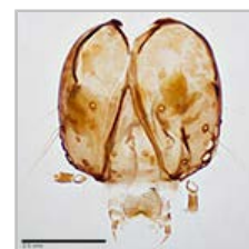
Fig. 6: Head