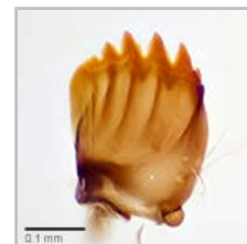
Fig. 8: Mandible