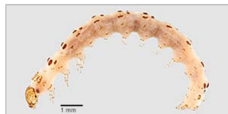
Fig. 3: Late instar, lateral view