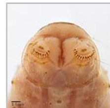
Fig. 5: Anal crochets