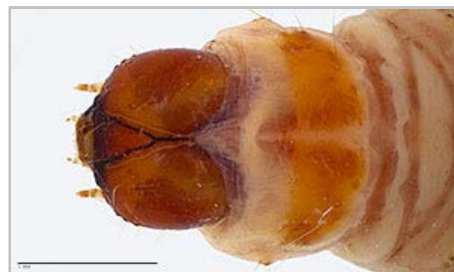
Fig. 3: T1 shield