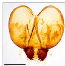
Fig. 6: Head