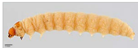
Fig. 2: Late instar, lateral view