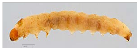
Fig. 1: Late instar, lateral view

The larva of P. gossypiella , the pink bollworm, has been described several times. Some examples are Busck (1917), Heinrich (1921), Capps (1958), Peterson (1962), Weisman (1986), Stehr (1987), Sri et al. (2010), and Schnitzler et al. (2011). Schmutterer (1990) photographed two color forms of the larva. One is an early instar with a dark head and prothoracic shield followed by segmental pink transverse bands on a light yellow ground color. The other is older and has the head, prothoracic shield and body colored light pink. The abdomen is paler between the segments. Color photographs in Hughes and Moore (2011) are similar to Schmutterer (1990).