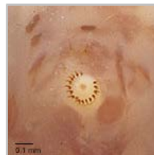
Fig. 4: Abd. crochets