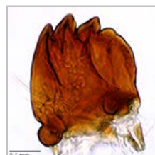
Fig. 8: Mandible