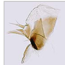
Fig. 8: Hypo. complex