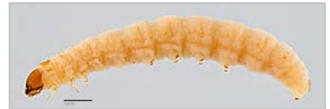
Fig. 1: Late instar, lateral view