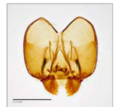
Fig. 5: Head