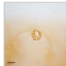
Fig. 4: Crochets