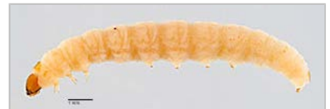
Fig. 2: Late instar, lateral view