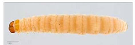
Fig. 3: Late instar, dorsal view