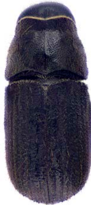
Fig. 17: Dendroctonus sp.

Figs. 15-17 (left): Native genera of the tribe Hylurgini. These beetles can be differentiated from Tomicus by differences in the setae structure and number of funicular segments of the antennae.