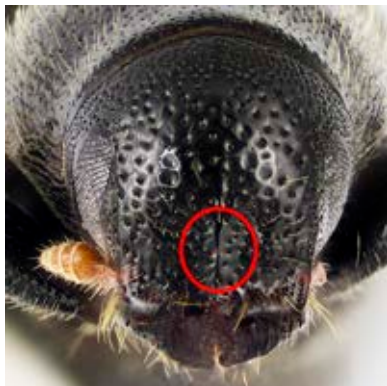
Fig. 18: Frons of Tomicus spp. Note the raised median line (circled).

Figs. 15-17 (left): Native genera of the tribe Hylurgini. These beetles can be differentiated from Tomicus by differences in the setae structure and number of funicular segments of the antennae.