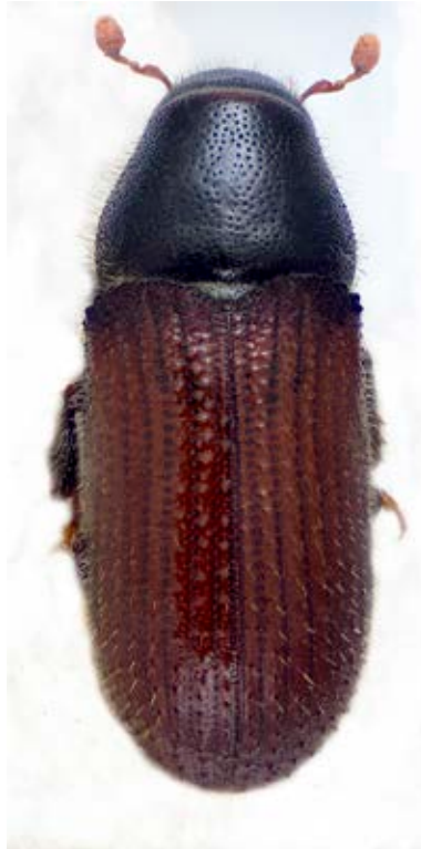
Fig. 10: Tomicus minor