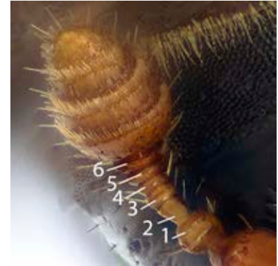
Fig. 5: Antenna of Tomicus spp. Note the long scape, large three part club and six segmented funicle (labeled).

Scolytids have relatively stout, geniculate, clubbed antennae. The clubs are made up of three antennomeres and can be solid, annulated, or occasionally lamellate. The scape will always be well developed (Fig. 5). In Tomicus the antennal funicle has six segments which differentiates it from most native members of the Hylurgini whose funicles are either five or seven segmented (Figs. 6-8).