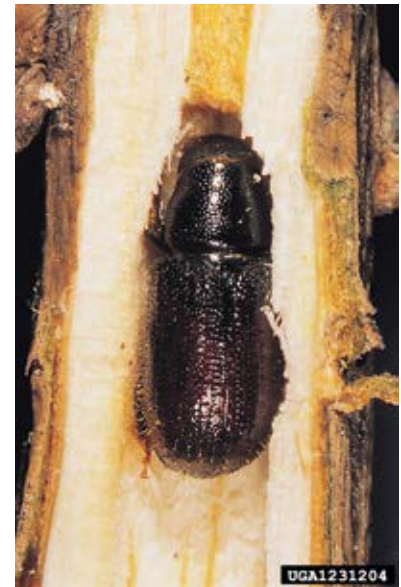
Fig. 1: Tomicus piniperda in a pine shoot.

This aid is designed to assist in the sorting and screening of suspect Tomicus spp. adults collected through visual survey and Lindgren funnel traps in the continental United States. It covers basic Sorting of traps and First Level Screening, all based on morphological characters. Basic knowledge of Coleoptera morphology is necessary to screen for Tomicus spp. suspects.