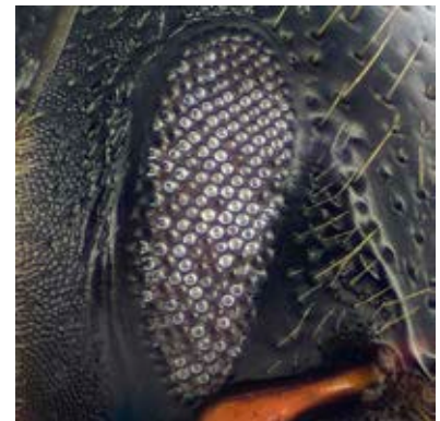
Fig. 20: Eye of Tomicus . In Tomicus the eyes are entire in form, fully oval in shape and not divided by a small projection of the head capsule down the eyes center.

The different Tomicus species are difficult to differentiate and their identification is beyond the scope of this aid. For keys to Tomicus see Brodel (2009) and Kirkendall et al. (2008).