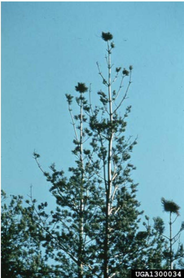
Fig. 3: Tree attacked by Tomicus piniperda . During a bark beetle attack trees will show little sign of damage other than a series of small bore holes. Often it is not apparent that bark beetles have infested a tree until after they have emerged (photo by . Richard Hoebeke Cornell University, Bugwood.org).

Beetles meeting these requirements should be forwarded to Level 1 Screening (Page 3).