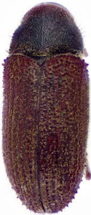
Fig. 15: Pseudohylesinus sp.