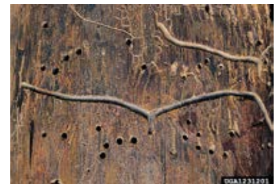
Fig. 2: Tomicus minor galleries.