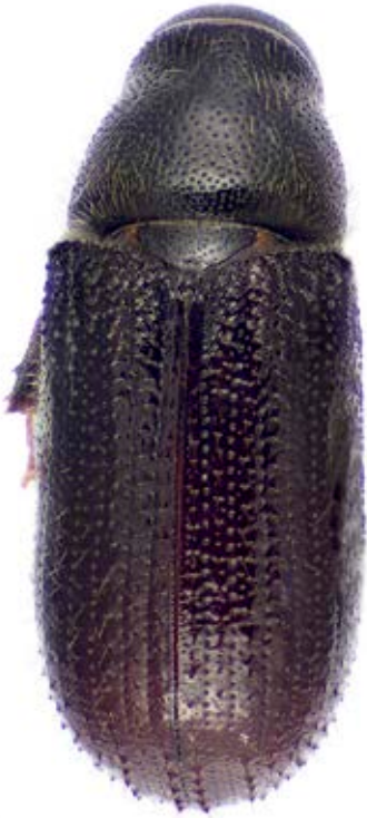
Fig. 9: Tomicus piniperda