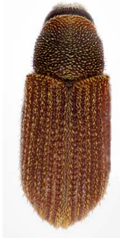
Fig. 16: Xylechinus sp.