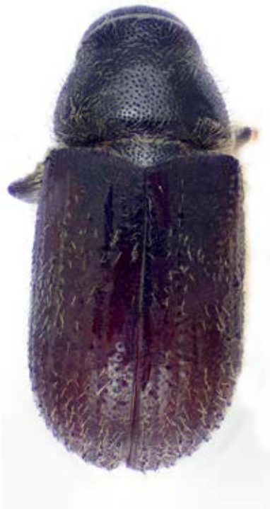
Fig. 12: Tomicus puellus