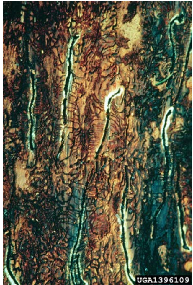
Fig. 4: Tomicus galleries infected with bluestain fungus. Many types of bark beetle spread this symbiotic fungus which aids in the destruction of the cambium of the tree.