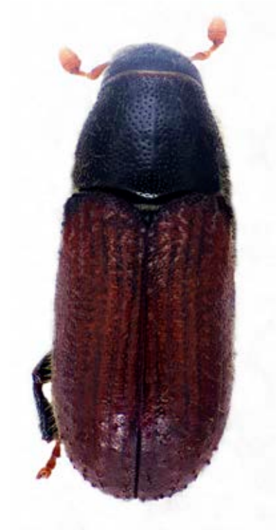
Fig. 11: Tomicus destruens