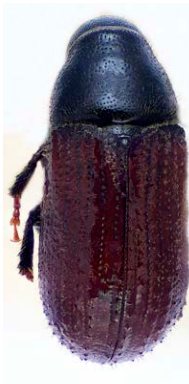
Fig. 13: Tomicus brevipilosus