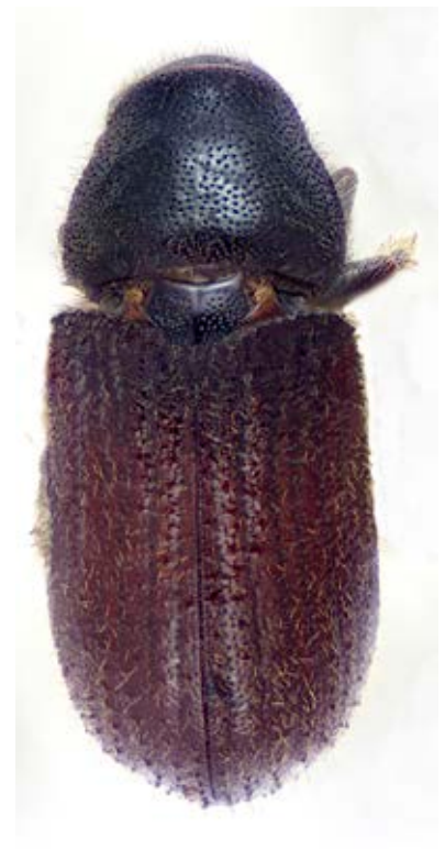
Fig. 14: Tomicus pilifer