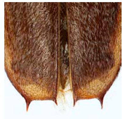
Fig. 7: Gnapholodes sp.

Figs. 6-7: Elytral apex of M. raddei (top) and Gnapholodes (bottom). Note the single small spine on the apex of M. raddei (circled).