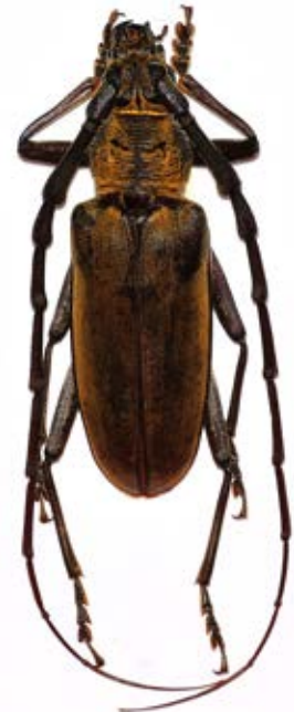
Fig. 1: Massicus raddei (actual size) (photo by Robert Parks).

This aid is designed to assist in the screening of M. raddei collected by visual surveys in the continental United States. It covers screening based on morphological characters. Basic knowledge of Coleoptera morphology is necessary to screen for M. raddei suspects.