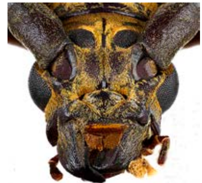
Fig. 2: Massicus raddei head.