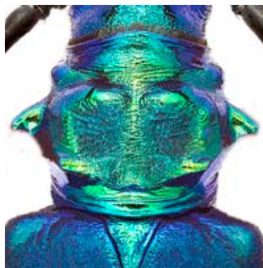
Fig. 5: Plinthocoelium sp.

Figs. 4-5: Pronotum of Massicus raddei (top) and Plinthocoelium sp. (bottom). Note the series of ridges and lack of lateral spines on M. raddei .