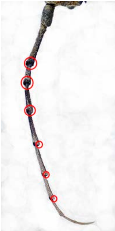
Fig. 3: Antenna of Massicus raddei . Note the large protuberance at the end of each antennomere (circled).

Each elytron of M. raddei bears a single small spine at the apex (Fig. 6). Most native cerambycids have an unarmed apex or one armed with a pair of longer spines (Fig. 7).