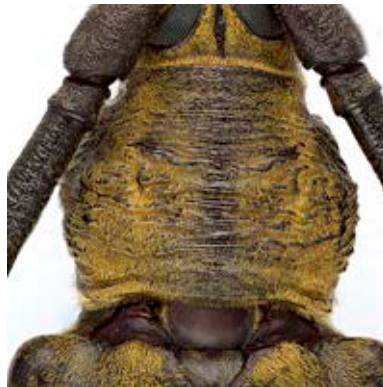
Fig. 4: Massicus raddei (target).